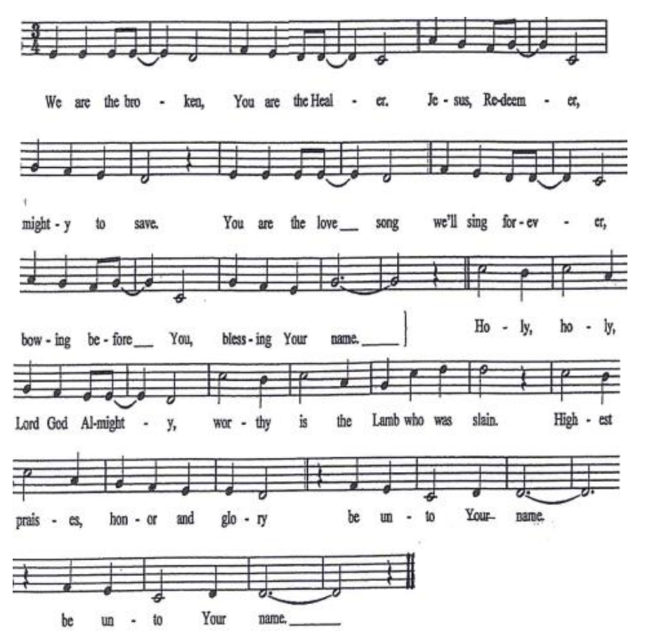
© 1998 Integrity's Hosanna! Music/ ASCAP CCLI License #11247411